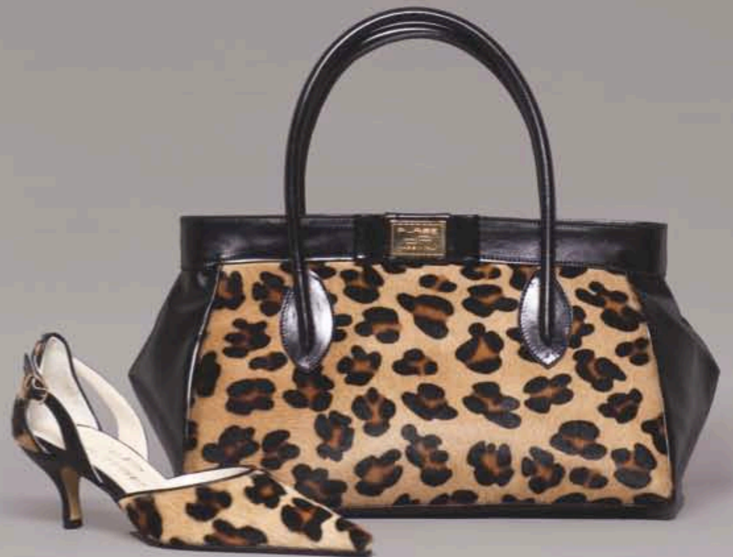
Shoes 764-C Bag v32-C