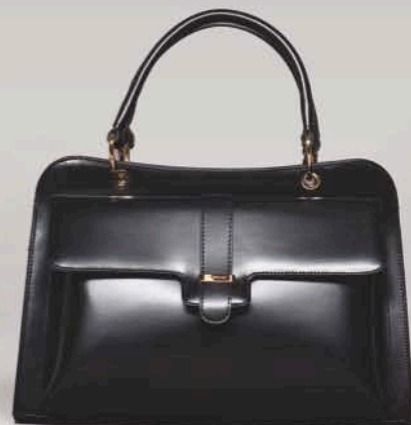
Bag 1149 Calf