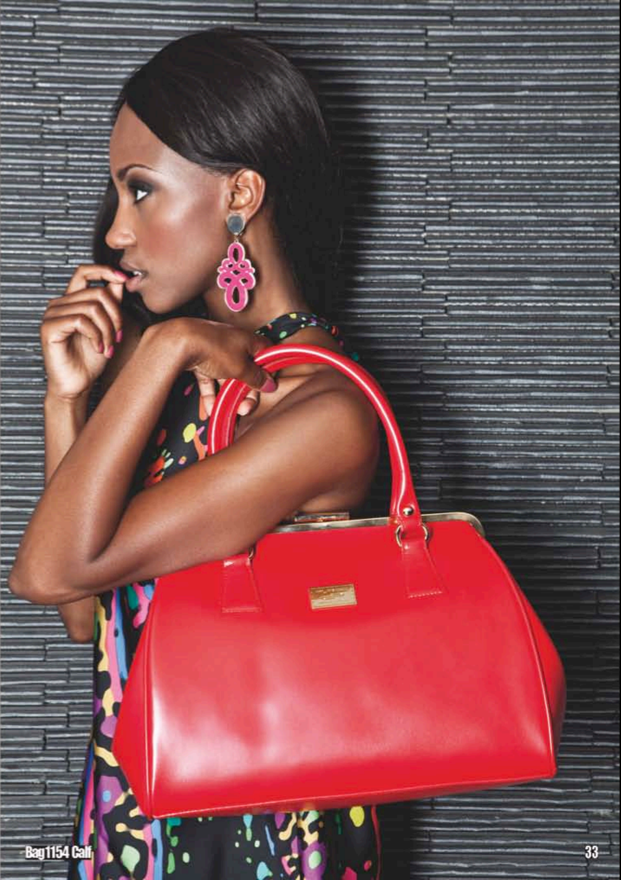
Bag 1154 Calif