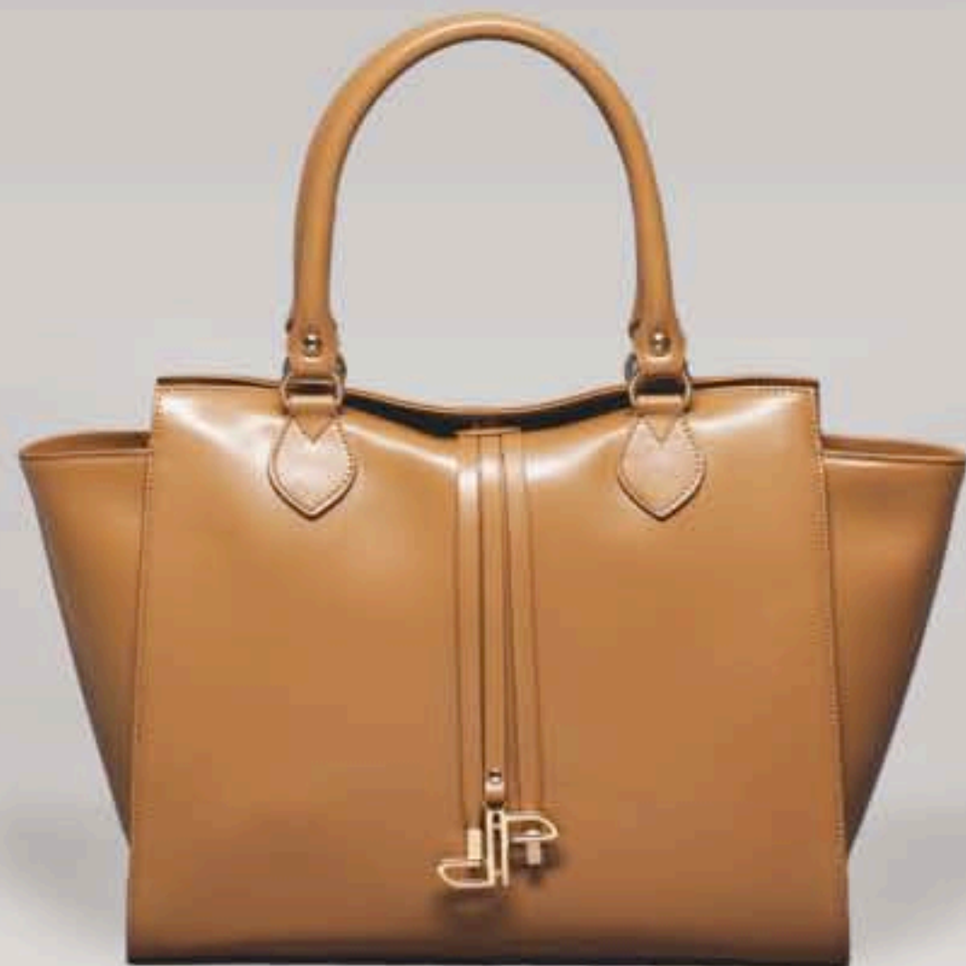
Bag 1147 calf