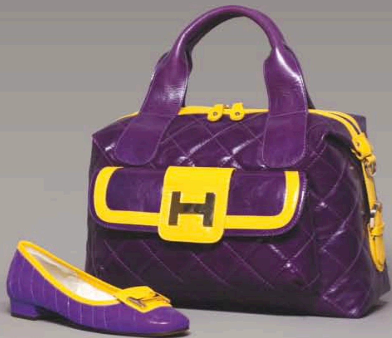
Shoes 793 Bag 4037