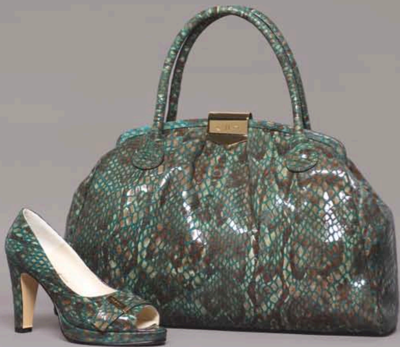
Shoe 718-P Bag v30-P